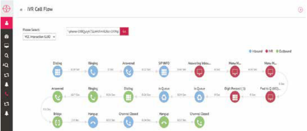
Infrastructure Monitoring Application – IVR Call Flow Diagram

Call “stitching” in real-time that includes the ability to view, sort, filter and zoom into a call.